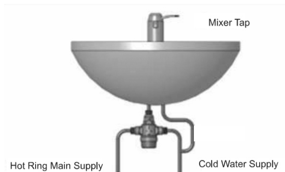
Typical installation sample